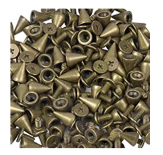
Silver Gold Bronze