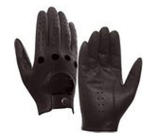
Brown Goatskin or Buckskin