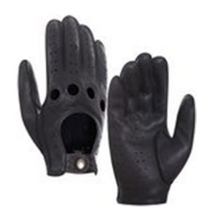
Black Goatskin or Buckskin